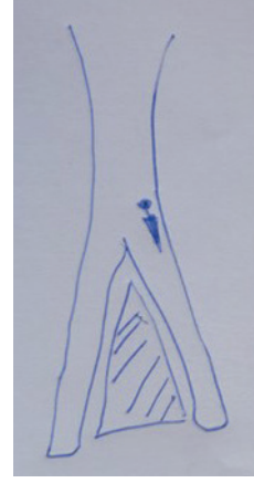
Sırt Üstü Yatış Pozisyonu